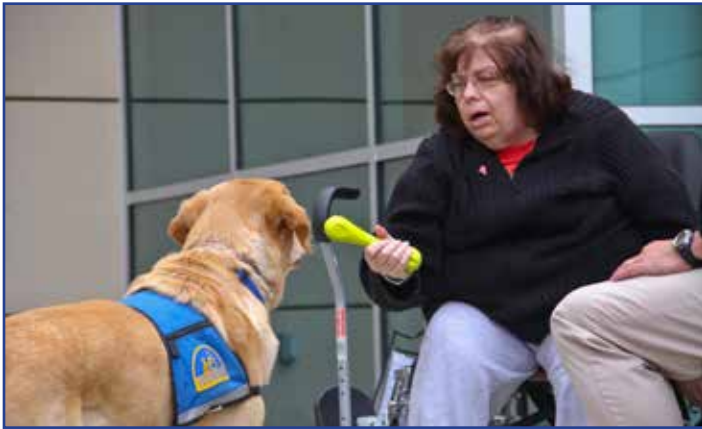
The conference featured Sherman, a Canine Companion at Kessler Institute. Here, Sherman works with a patient.