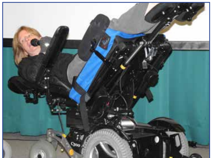
Mary Shea, OT, ATP demonstrating the tilt feature of a motorized wheelchair

and paralysis, as well as endocrinological changes, may result in sexual dysfunction," she noted. "Anatomical and neurological abnormalities that adversely affect cognition and behavior can also have an impact on sexual interactions." A multidisciplinary approach can diagnose sexual dysfunction and develop a treatment plan.