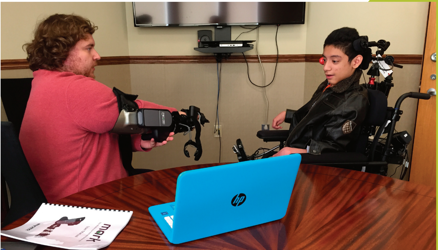
A research assistant demonstrates wearing a robotic arm brace by Myomo.