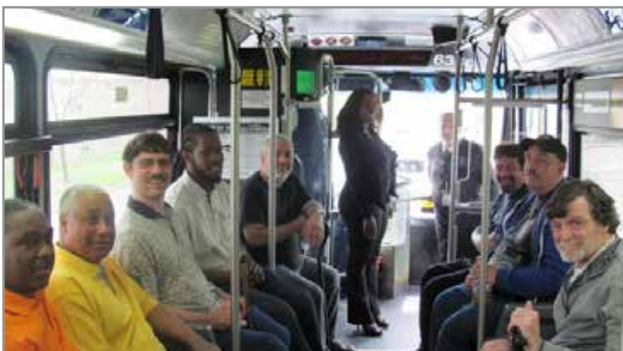
NJTIP @ Rutgers Connect to Transit bus demonstration at Opportunity Project, May 7, 2014

Lessons are taught in many different ways and are customizable to the individual or group. Programs include One-on-One Travel Instruction and Small Group Travel Instruction. Additional seminars and services, such as Train-the-Trainer and In-School Travel Instruction are available for professionals and students in high school transition programs, respectively.