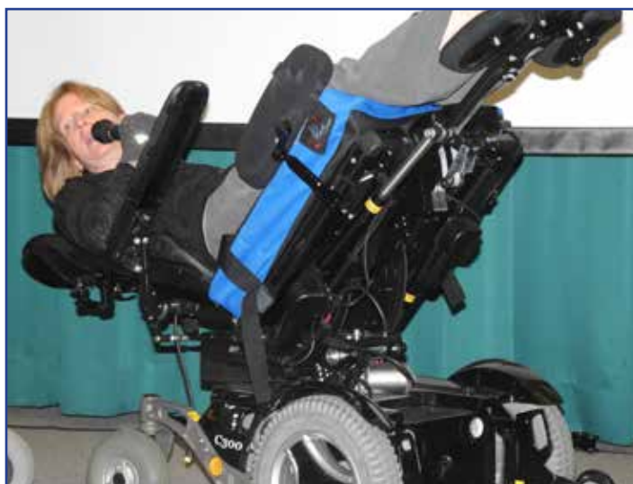
Mary Shea, OT, ATP demonstrating the tilt feature of a motorized wheelchair

"Physiological changes, such as spasticity and paralysis, as well as endocrinological changes, may result in sexual dysfunction," she noted. "Anatomical and neurological abnormalities that adversely affect cognition and behavior can also have an impact on sexual interactions." A multidisciplinary approach can diagnose sexual dysfunction and develop a treatment plan.