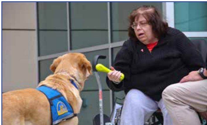
The conference featured Sherman, a Canine Companion at Kessler Institute. Here, Sherman works with a patient.