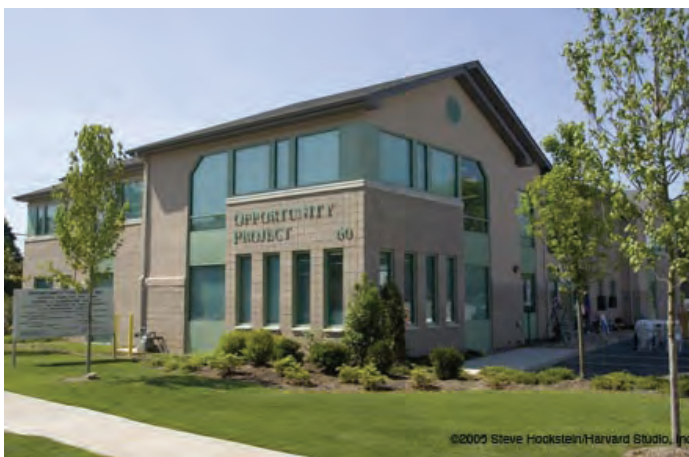
Opportunity Project, Millburn, NJ

Because members are encouraged to achieve as much independence as possible, employment is a major focus of the Project. Through the Vocational Unit, members work with the vocational counselor to determine the best application of their interests and skills to the workforce.